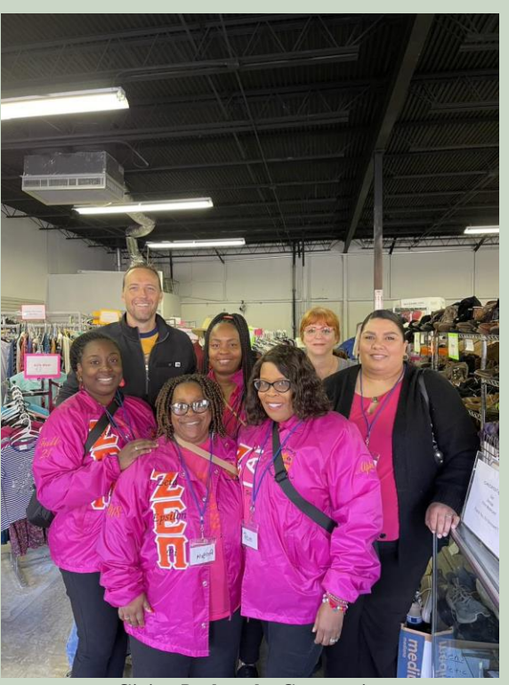
Giving Back to the Community