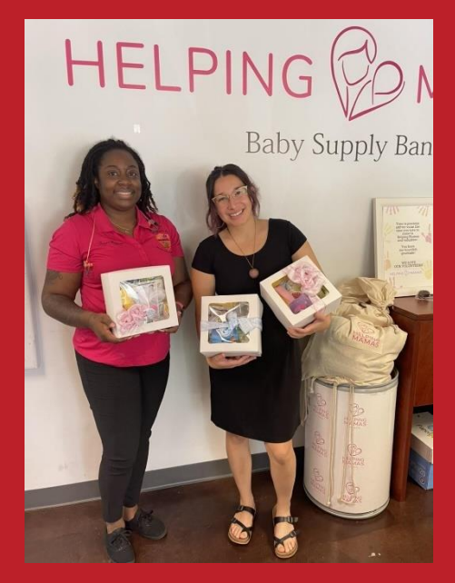
Donated Baby Supplies