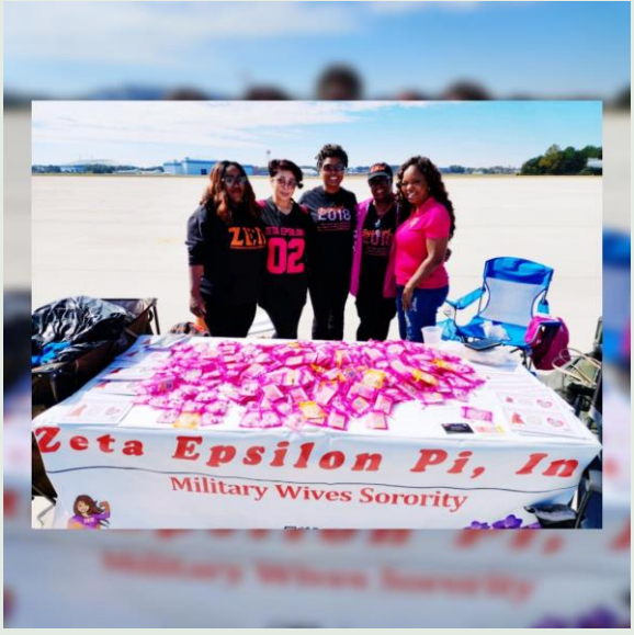
Dobbins Air Force Base