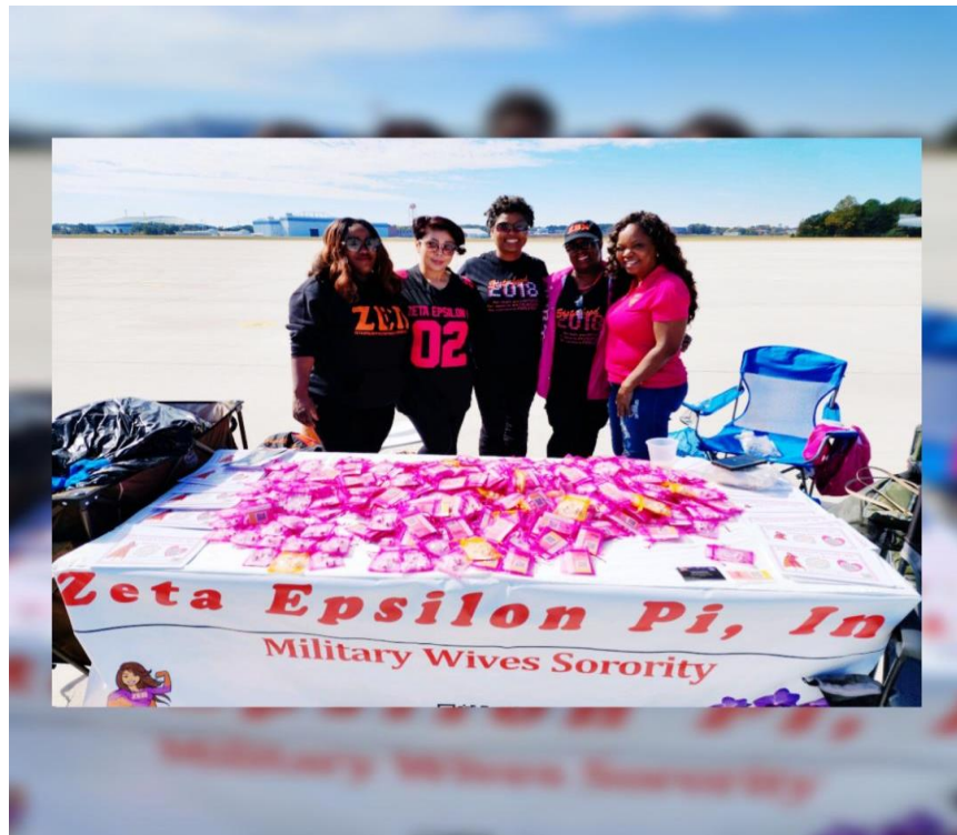
The ladies of ZEN Community Service at Dobbins Air Reserve Base.