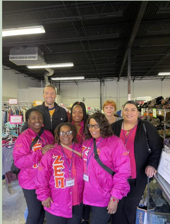
Giving Back to the Community