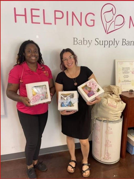
Donated Baby Supplies