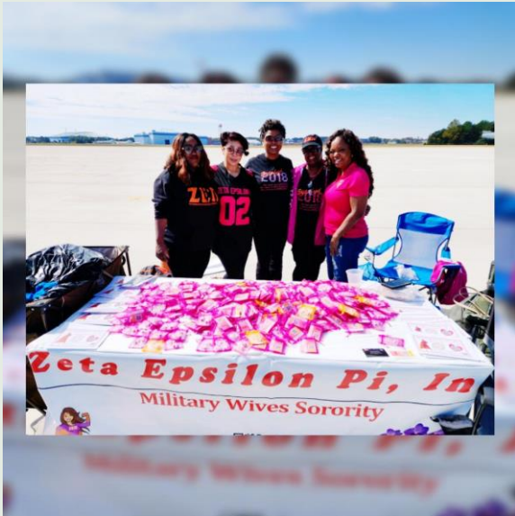
Dobbins Air Force Base